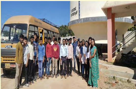
1st year Civil Engineering students along with staff members visited Bugudanahalli