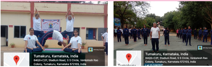
Yoga day celebration at our 4 Kar Bn, NCC, Tumkur. (Our Cdts and ANO Present)