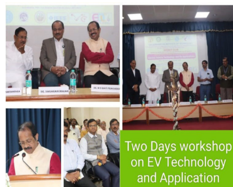
Two Days workshop on EV Technology and Application