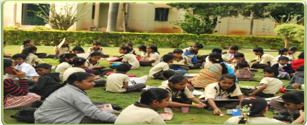
Dr H M Gangadhariah Memorial On the spot painting competition