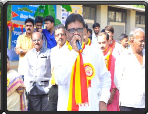
KANNADA RAJYAOTSAVA CELEBRATION IN COLLEGE