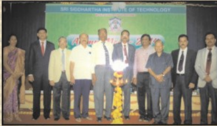
Alumni Meet - 2014