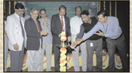
MCA Conference 2015