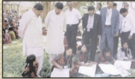
On the Spot Painting Competition - 2014